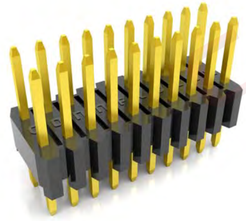
(Series Image-Reference Only)